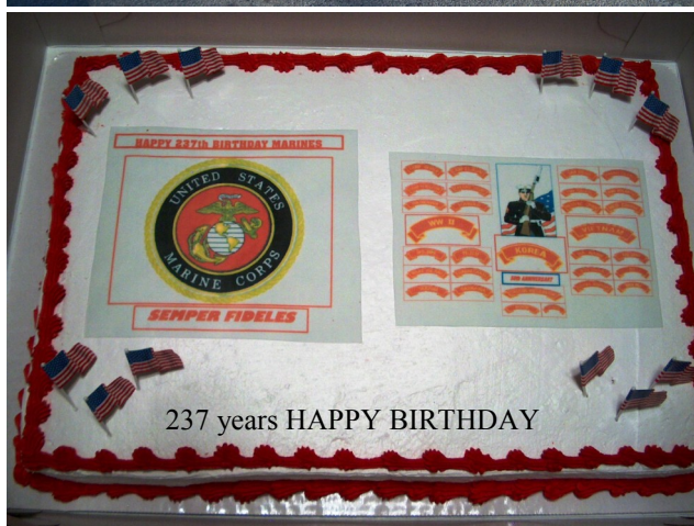
237 years HAPPY BIRTHDAY