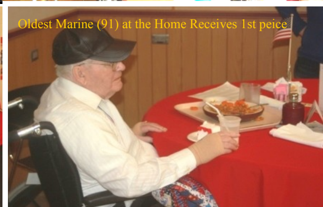
Oldest Marine (91) at the Home Receives 1st piece